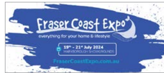
Facebook Cover 4