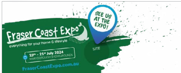
Email Signature Template 1