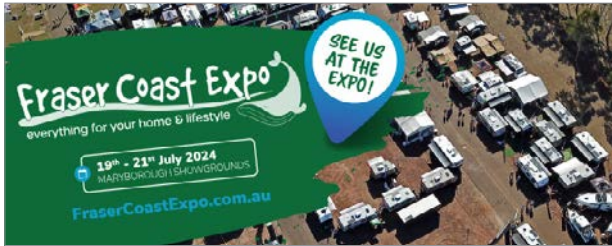
Email Signature 1