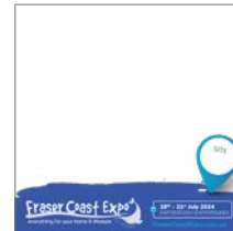
Social Media Post Template 2