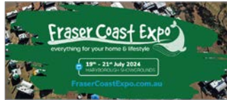
Facebook Cover 1