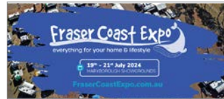
Facebook Cover 2