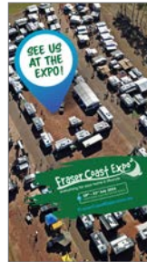
Social Media Story