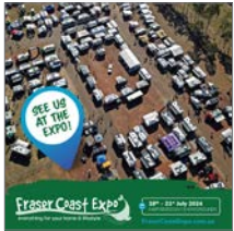
Social Media Post 1