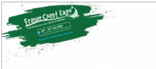
Facebook Cover Template 1