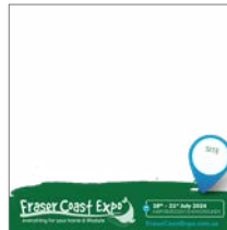
Social Media Post Template 1