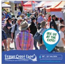
Social Media Post 2